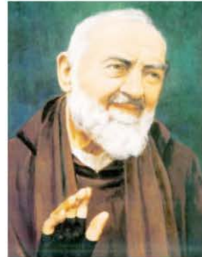
St. Pio of Pietrelcina Feast Day is September 23 Patron of All Who Suffer