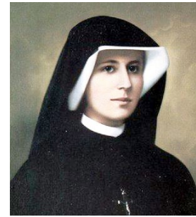
Saint Maria Faustina Kowalska

Jesus, who filled your handmaid Saint Faustina with profound veneration for your boundless Mercy, deign, if it be your Holy Will, to grant me, through her intercession, the grace for which I fervently pray (here make your request).