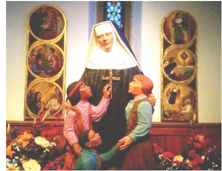
Saint Katharine Drexel Feast Day is March 3